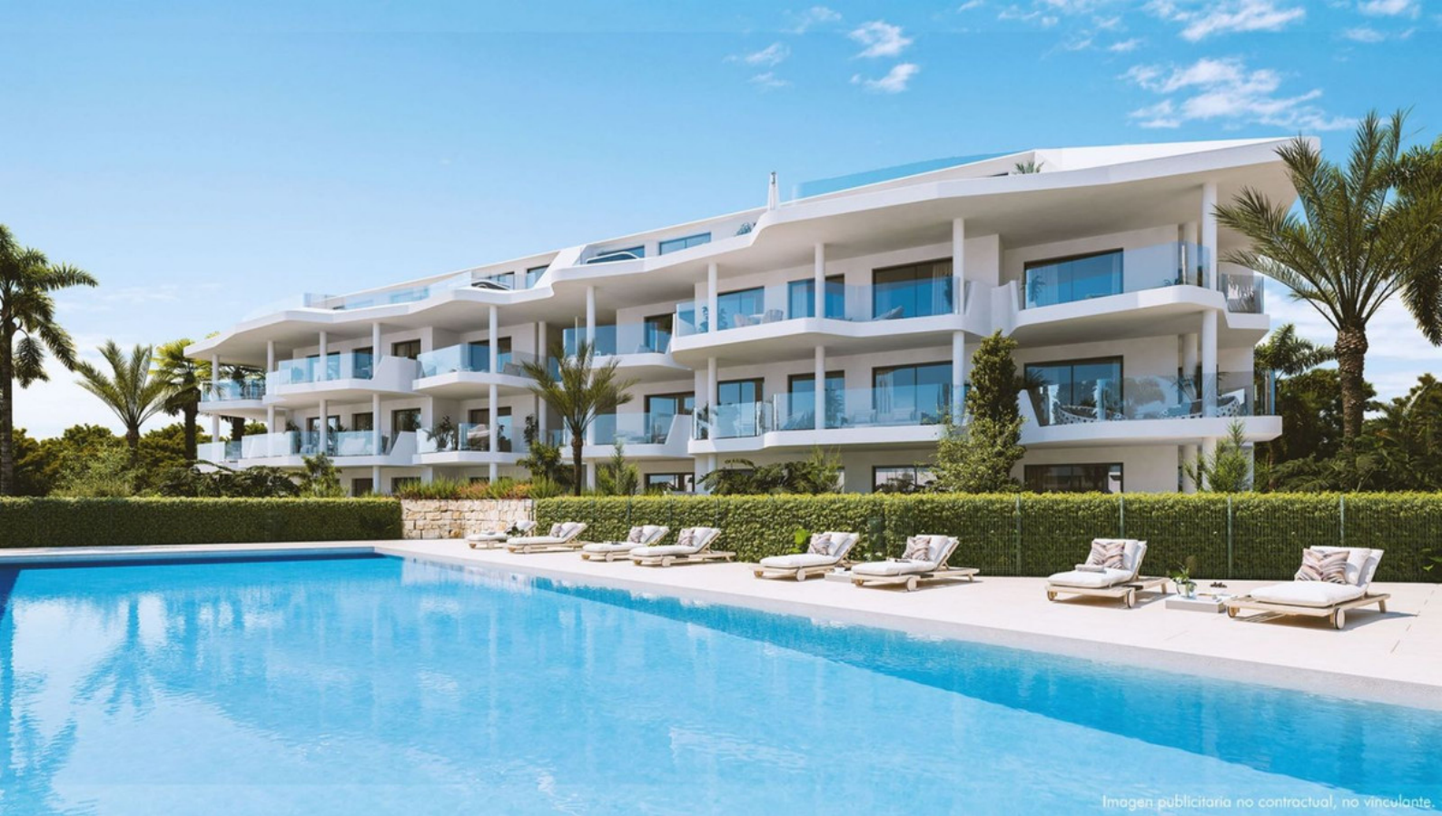
Imagen publicitaria no contractual, no vinculante.