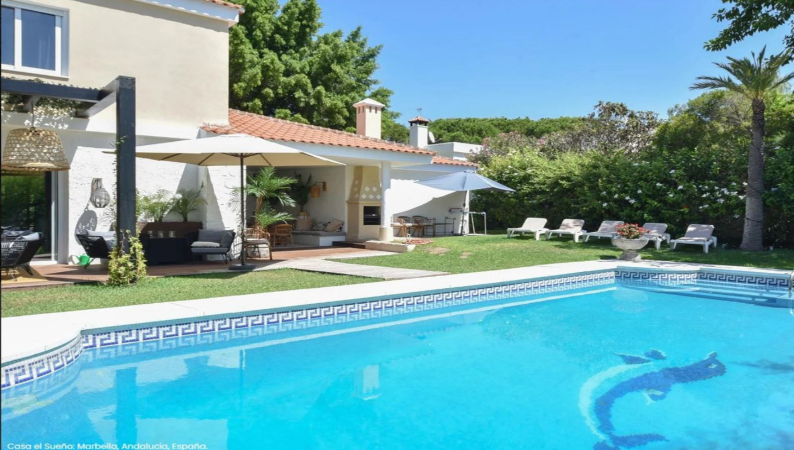
Casa el Sueño: Marbella, Andalucía, España.