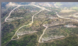
(Example proposed, not actual project)

Situated on the Western part of the urbanisation, spread on several ridges, boasting fantastic Southern views across the river Guadalmansa to the Mediterranean sea. Most properties will be able to have the highly demanded South or West orientation.