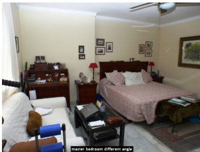
master bedroom different angle