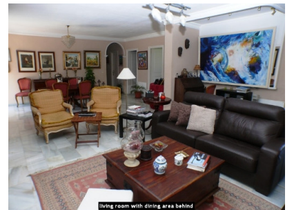
living room with dining area behind