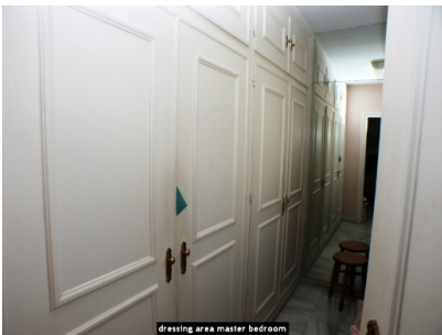
dressing area master bedroom